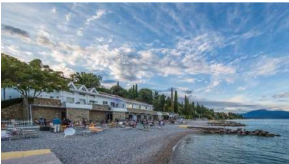
Lido di Padenghe