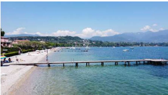
Spiaggia della Romantica