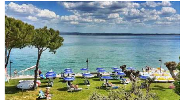
Spiaggia Comunale di Santa Maria di Lugana