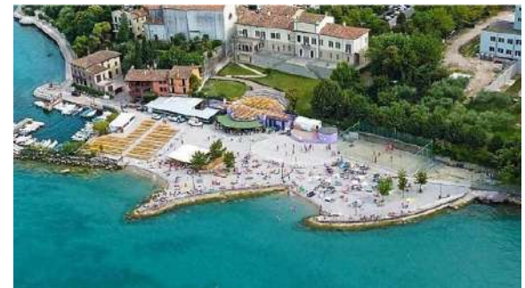
Spiaggia Porto Rivoltella