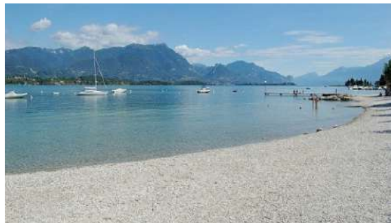
Porto Torchio beach